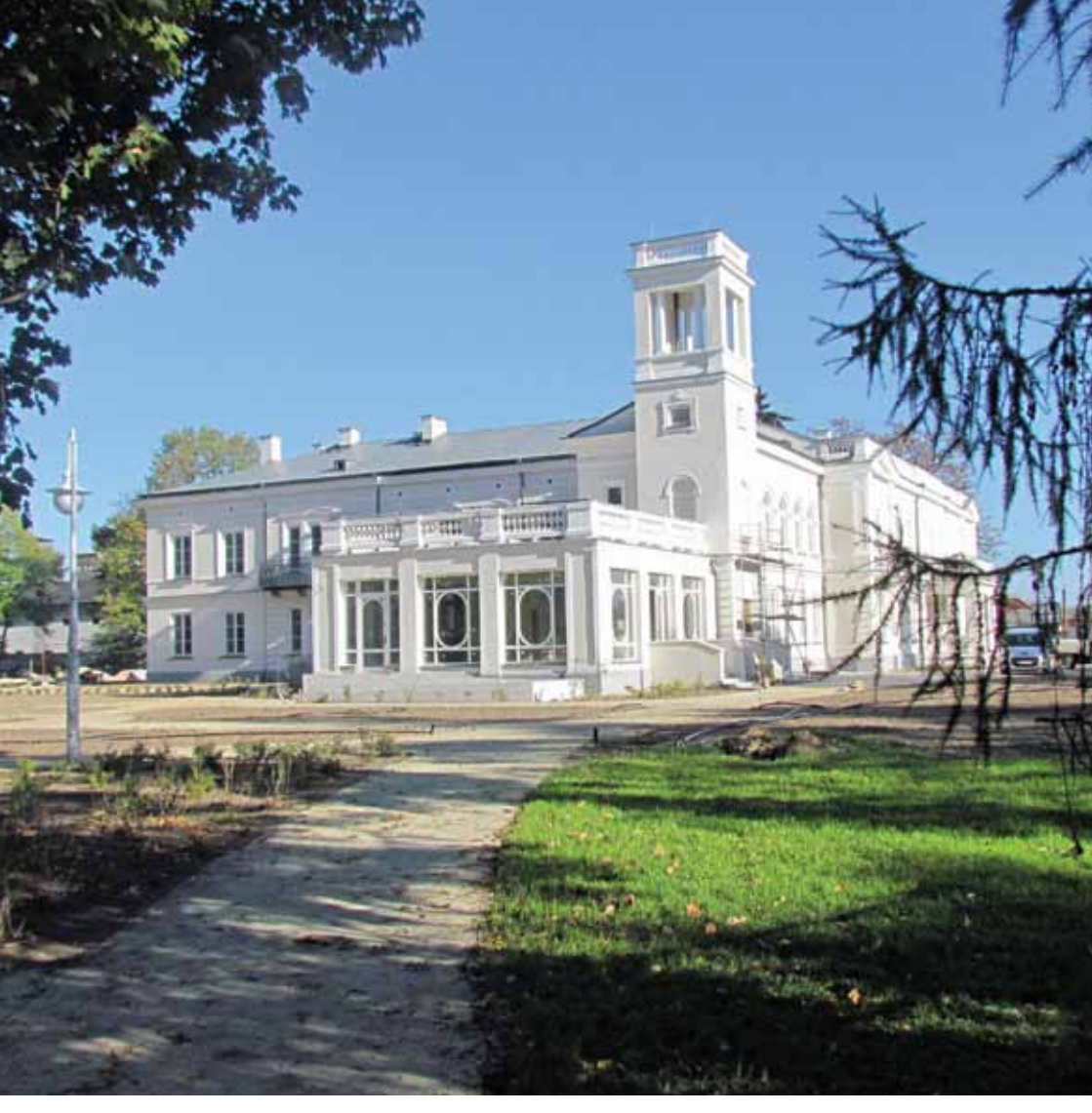
The Pruszaks' palace in Sanniki, where Chopin composed his masterpieces

in Jabłonna; the Radziwiłłs palaces in Zegrze and Jadwisin; the nineteenth-century military architecture monuments in Beniaminów, Zegrze, Dębe and Janówek; the military cemetery in the town of Radzymin – place of eternal rest of the heroes of the 1920 Battle of Warsaw; as well as works of civil engineering such as the Żerań Canal and the dam on the Narew River with its hydro-electric power plant in the village of Dębe. A number of these spots and monuments may be reached by tourist boats fleet.