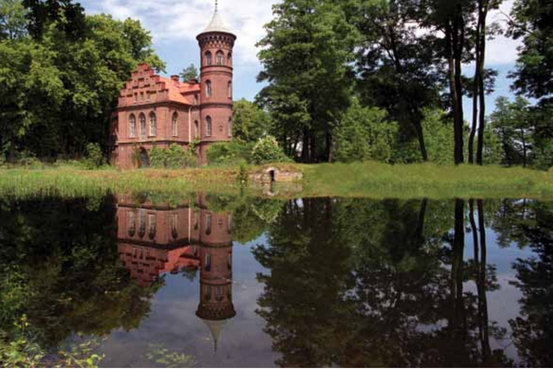
Neo-Gothic castle in Nowy Duninów

region of Żuławy and later on in the areas around the lower and middle Vistula, where they were granted land and personal and religious freedom as well as exemption from military service and serfdom in return for developing floodland. In the 18th century, they were followed by other settlers from the Netherlands and Lower Germany – in Poland they were called Olęders, just like Mennonites were – and then by other settlers from Germany and Prussia, who soon started to outnumber the other ones.