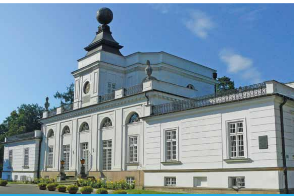
The Poniatowskis and Potockis palace in Jablonna

The area is the largest hydro node in Poland; it is here that three out of the four biggest Polish rivers, namely the Vistula, Narew and Bug, and a number of flows and canals converge. The water coverage rate of the area equals the one of Finland!