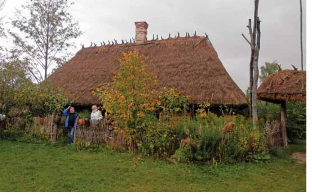
Open-air museum in Kuligów

Although located just outside Warsaw, Lake Zegrzyńskie area preserves its outstanding natural beauty; as much as 49% of the area is under legal protection. The region boasts nine Natura 2000 areas, ten nature reserves and over 170 nature monuments. The forestation rate in some of the region"s communes (e.g. Jabłonna and Nieporet) exceeds 40%.