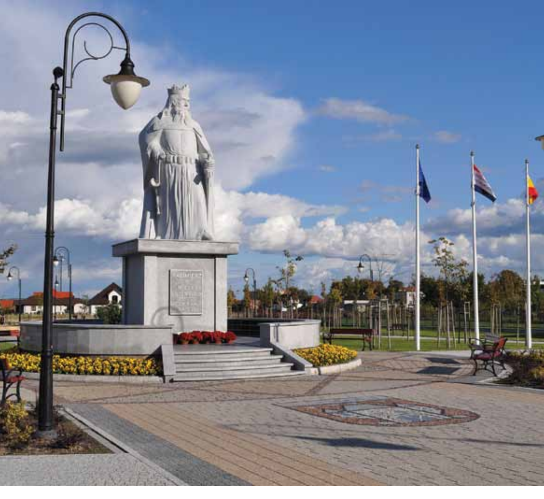
King Casimir the Great park in Kowal

born in 1310, whereas the Mazovian city of Plock was the seat of kings Ladislaus Herman and Boleslaus the Wry-Mouthed. They were buried in Plock cathedral, where their sarcophagus can be visited.