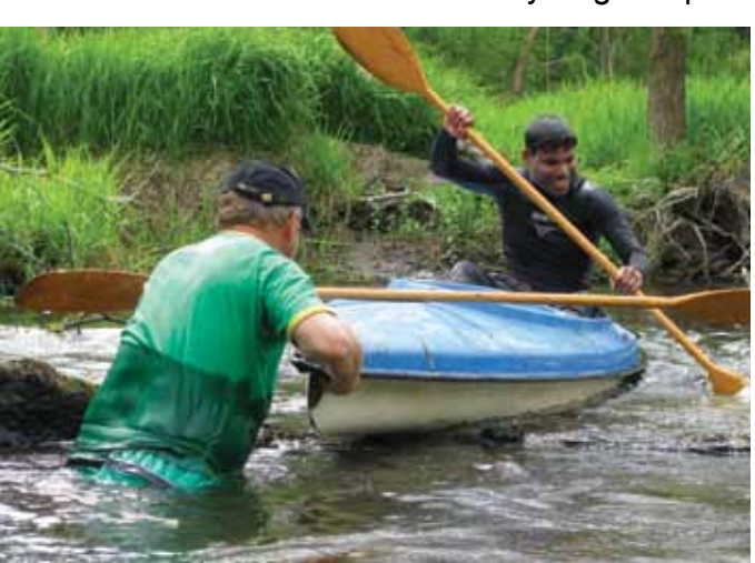
Paddling down the Skrwa Lewa River

Only a few people may ever hope to travel to South America to admire the Amazon River. However, you may feel as if you were at the Amazon while visiting Mazovia, too. Canoeing down the Vistula River and its branches from the town of Wyszogród up to the village of Nowy Duninów,