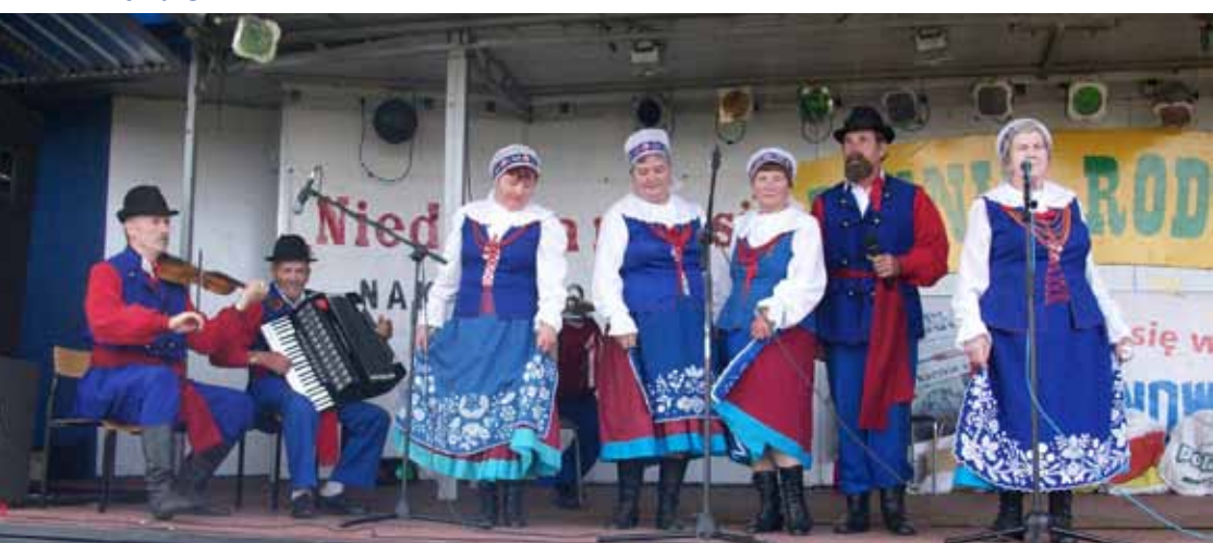
Kapela spod Kowala folk band

The Vistula Borderland of Mazovia and Kujavia is a land rich with the folk art of White Kujavia and the Sanniki and Gąbin Land. A number of folk artists and groups are active in the region, and numerous cultural events are held there every year. Visitors who are interested in folk art may also participate in art and handicraft workshops organised by various institutions promoting the culture of the region.