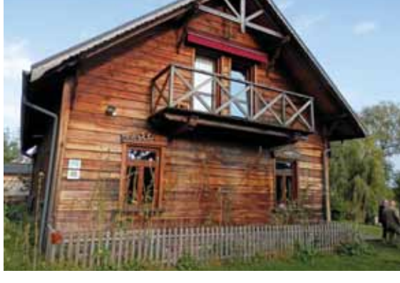
Dom nad Wierzbami ecotourism facility

Wine-tasting session under the star-filled sky.