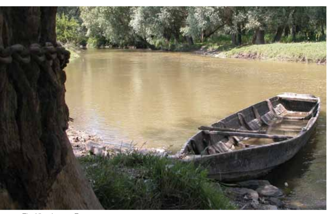
The Vistula near Troszyn

Cemetery in which Polish Army soldiers who died in 1939 were buried, Wieliszew